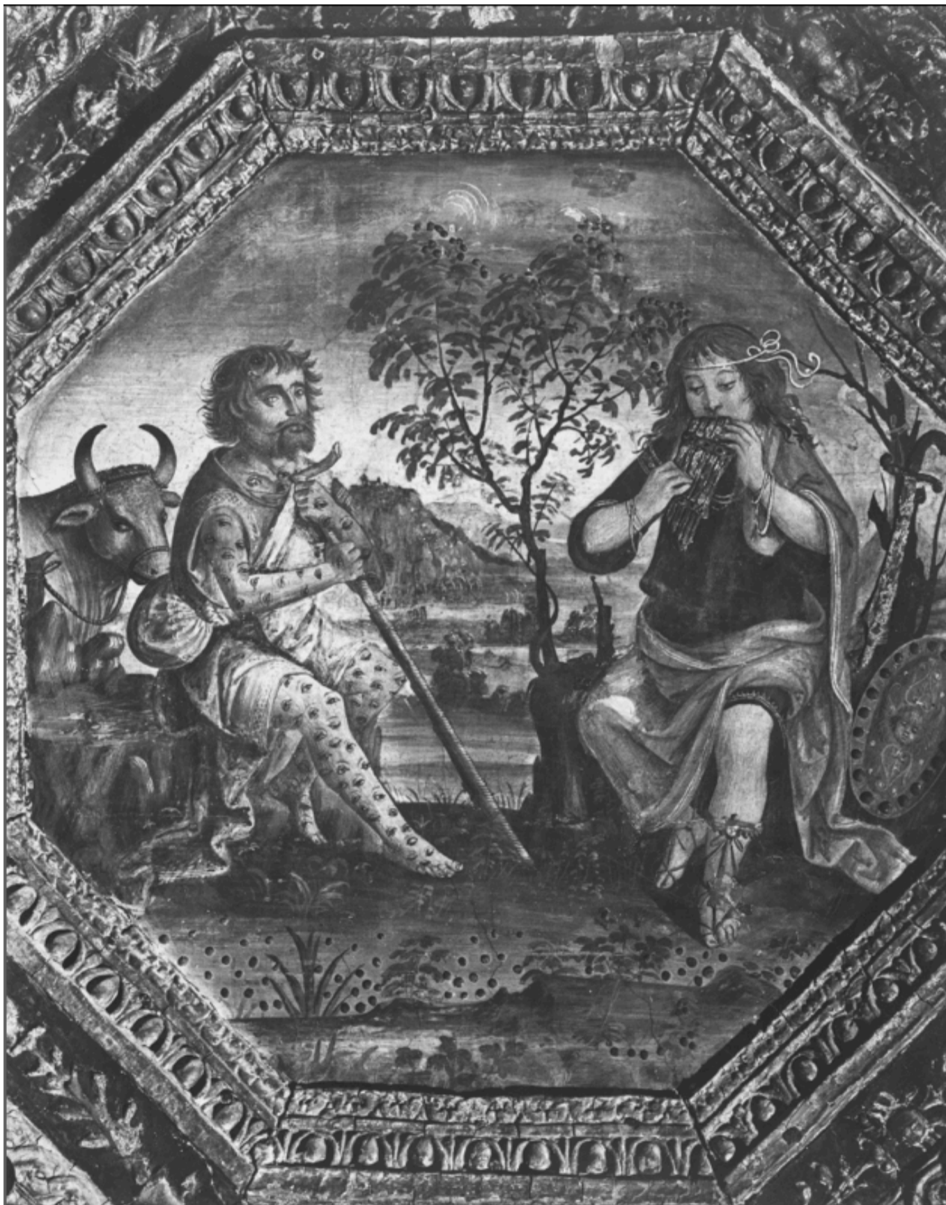
1492-1494 Pinturicchio, Bernardino (circa 1452-1513)